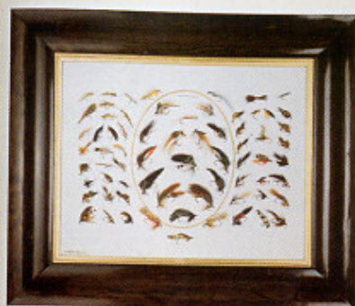
Plate 21. New Zealand lures, 1911-1972

Plate 21. New Zealand lures, 1911-1972 Taupo and Rotorua - Patterns 1-29 Canterbury Lures - Patterns 30-44 High Country Lures - Patterns 45-66